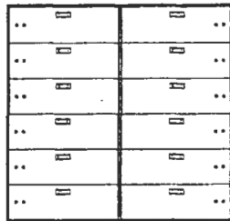
Teller Locker Model SDL-12