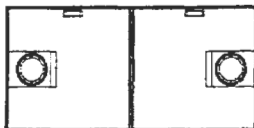
Vault Locker Model SDL-2